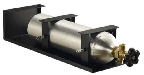
ATMOSPHERE<sup>APS</sup>, MAX 3000<sup>APS</sup>